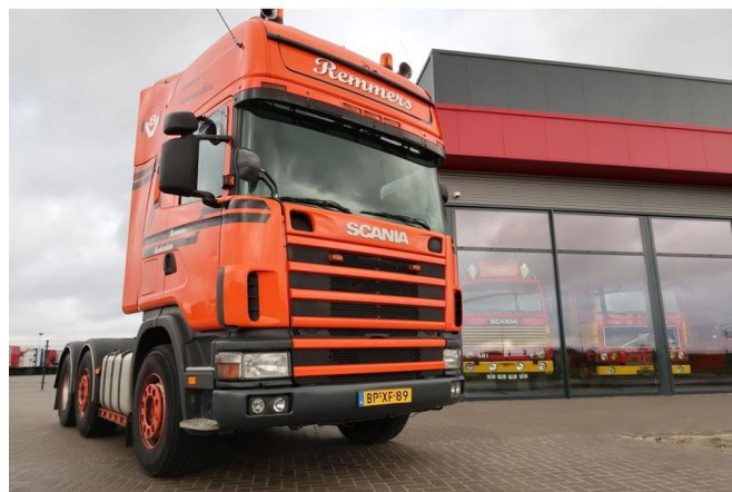
Scania R164-580 V8 R 164 GA 6x2 ...